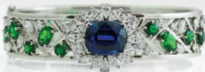
Sapphire, Green Garnet & Diamond Bracelet Handcrafted in 19K White Gold

2832 Granville Street, Vancouver 604.736.6016 www.mjjewellers.ca